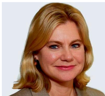
The Rt Hon JUSTINE GREENING MP Secretary of State for Education

However, in some cases, support from the NHS is only available when problems get really serious, is not consistently available across the country, and young people can sometimes wait too long to receive that support. Support for good mental health in schools and colleges is also not consistently available. This green paper therefore sets out an ambition for earlier intervention and prevention, a boost in support for the role played by schools and colleges, and better, faster access to NHS services, in order to fill these gaps and fulfil the commitments set out in our manifesto. We set out here specific proposals that represent a fundamental shift in how we will support all young people with their mental health, and we look forward to working with you in making these proposals a reality.