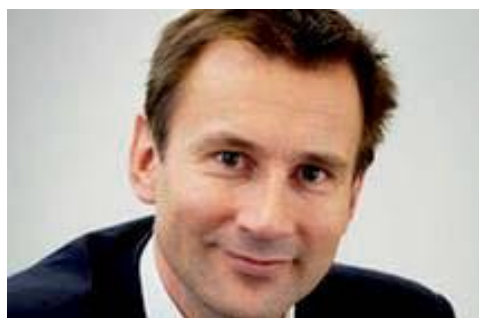
The Rt Hon JEREMY HUNT MP Secretary of State for Health